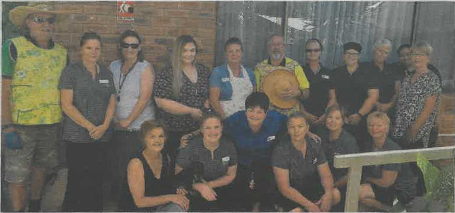
Staff at Murrayvale Aged Care.